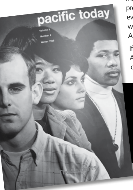
Pacific Today , alumni magazine — Winter 1969