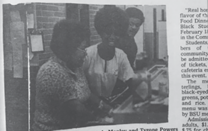
Black Cultural Week, 1973 | Poster Soul Food Dinners, 1970–1980s | Dinner