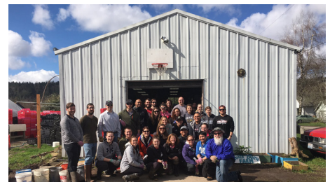
Students from the MSAT program at Pacific University join students from other CAATE accredited programs in District 10 at Mother Earth Farm in Puyallup, Washington.