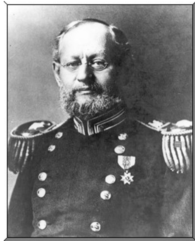
General Henry M. Robert, U.S. Army